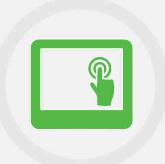
Optional 15" or 19" multi-touch display. Optional full interactive teller and services capability